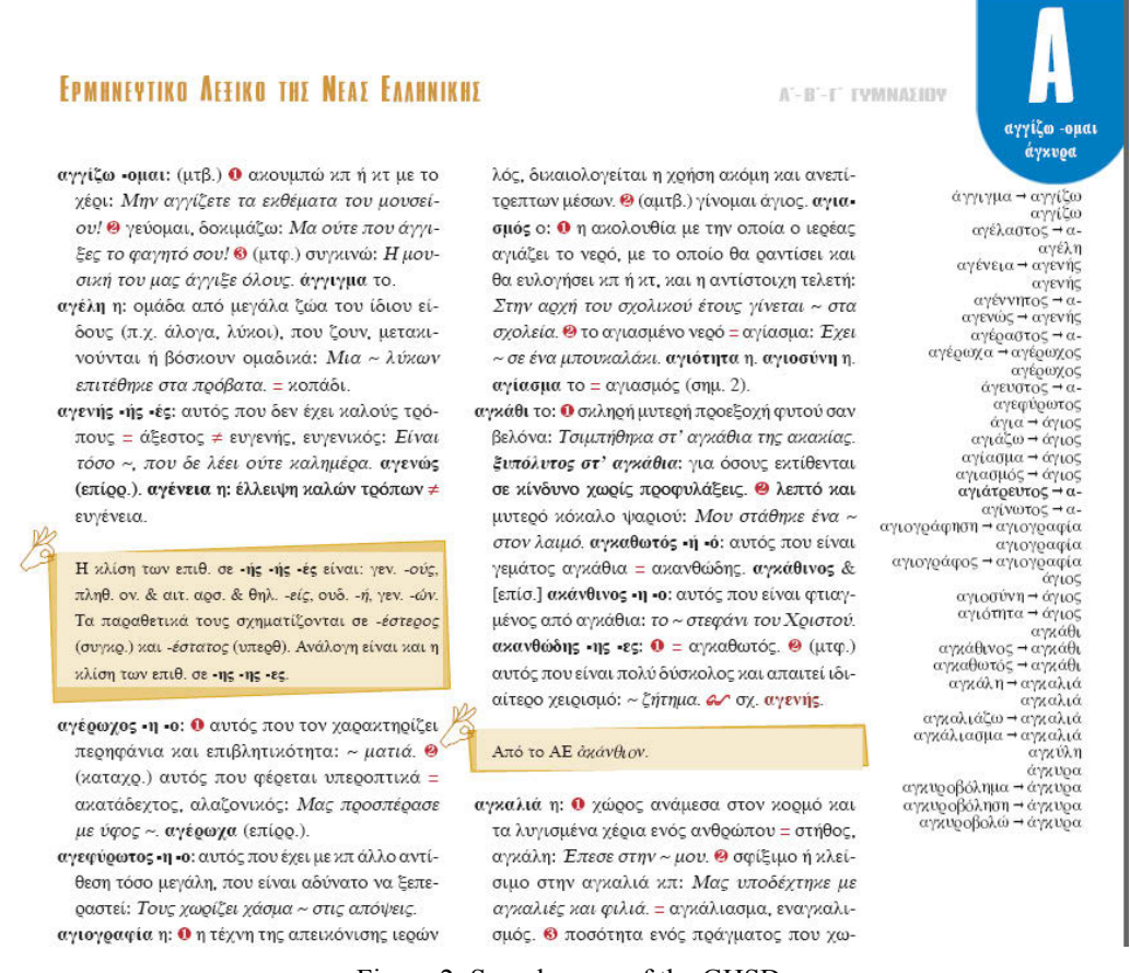
Figure 2: Sample page of the GHSD

The described lemma organization contributes also to a much desired lexicographical goal, namely economy in space (see also sections 6 and 8). However, it also poses a burden on users, who find it difficult to spot the word they are looking for and might be, therefore, discouraged from further use of the dictionary. For this reason, the alphabetical index has been introduced to the dictionary: it appears on the side of each page (Figure 2), includes all the lemmas and sub-lemmas in alphabetical order, and directs the user to the appropriate lemma where these are located. It also contains difficult inflected words (distinctively marked), common misspellings and spelling variants, in order to facilitate dictionary lookup.